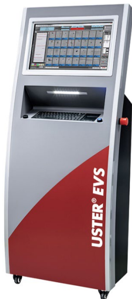
Uster EVS Fabriq Vision control panel

Uster Technologies also invite interested parties to face-to-face discussions at Techtextil Frankfurt, from April 23 to 26, 2024. Meet their fabric inspection experts at the Elmatex booth D63 (Uster agent for Germany) in hall 12.